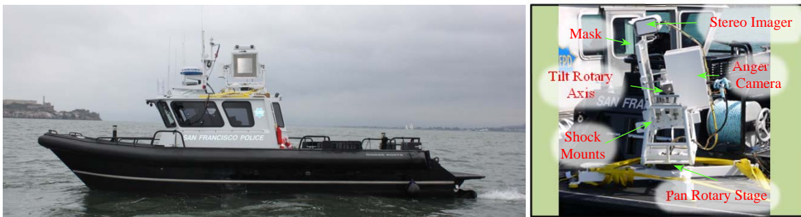
Fig. 1. Ship-to-ship imager mounted to the roof of a SFPD patrol vessel (left). Side view of the instrument (right.)

The project leverages earlier work where we first measured the relative motion expected for small vessel-to-vessel radiation inspections. Using this information together with concepts of operations for inspections, we developed suitable hardware for such inspections. That hardware was deployed on the water for the first time early in FY13. For the remainder of the year we have worked to analyze that data and improve the performance of the system.