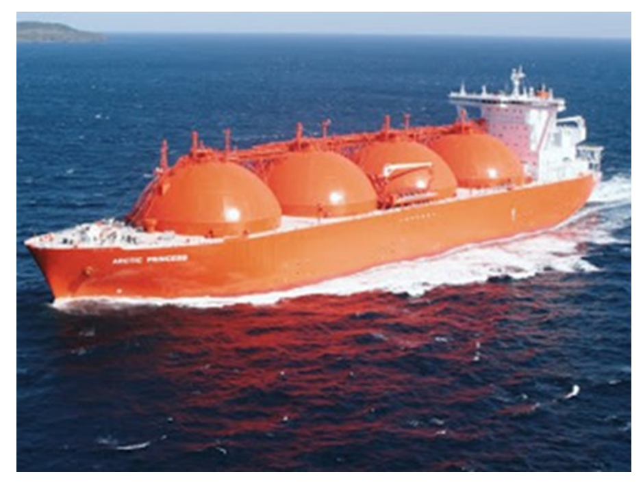
Figure 1. Photograph of an LNG cargo vessel. Note that the LNG is stored in large tanks on deck. Photo is licensed under CC BY-SA.

Retrofitting existing vessels or building new vessels with the capability to use LNG is another option that has been widely discussed. The challenges associated with LNG are (1) the added costs of LNG storage infrastructure, (2) limited range due to the lower energy content of LNG relative to residual and distillate fuels, and (3) reduced carrying capacity due to the requirement that LNG tanks must be above deck (see Figure 1). However, relatively low LNG prices are expected to help improve the economic challenges. Another key factor that could limit the adoption of LNG-fueled vessels is the currently limited infrastructure for LNG supply and distribution for use in marine vessels. Expanding the infrastructure will come at a price and will influence the overall cost of LNG options, although increasing global trade of natural gas and the associated infrastructure could help offset a portion of this cost. Based on IHS estimates, as of early 2017 only 10 LNG vessels had entered the market [IHS 2017]; however, 9 LNG cargo vessels are under construction in China, and 6 more are under construction in other countries. The on-deck LNG storage requirement not only limits cargo space but also imparts challenges for loading and offloading. LNG use and efficiency would be greatly facilitated with the approval of below-deck storage.