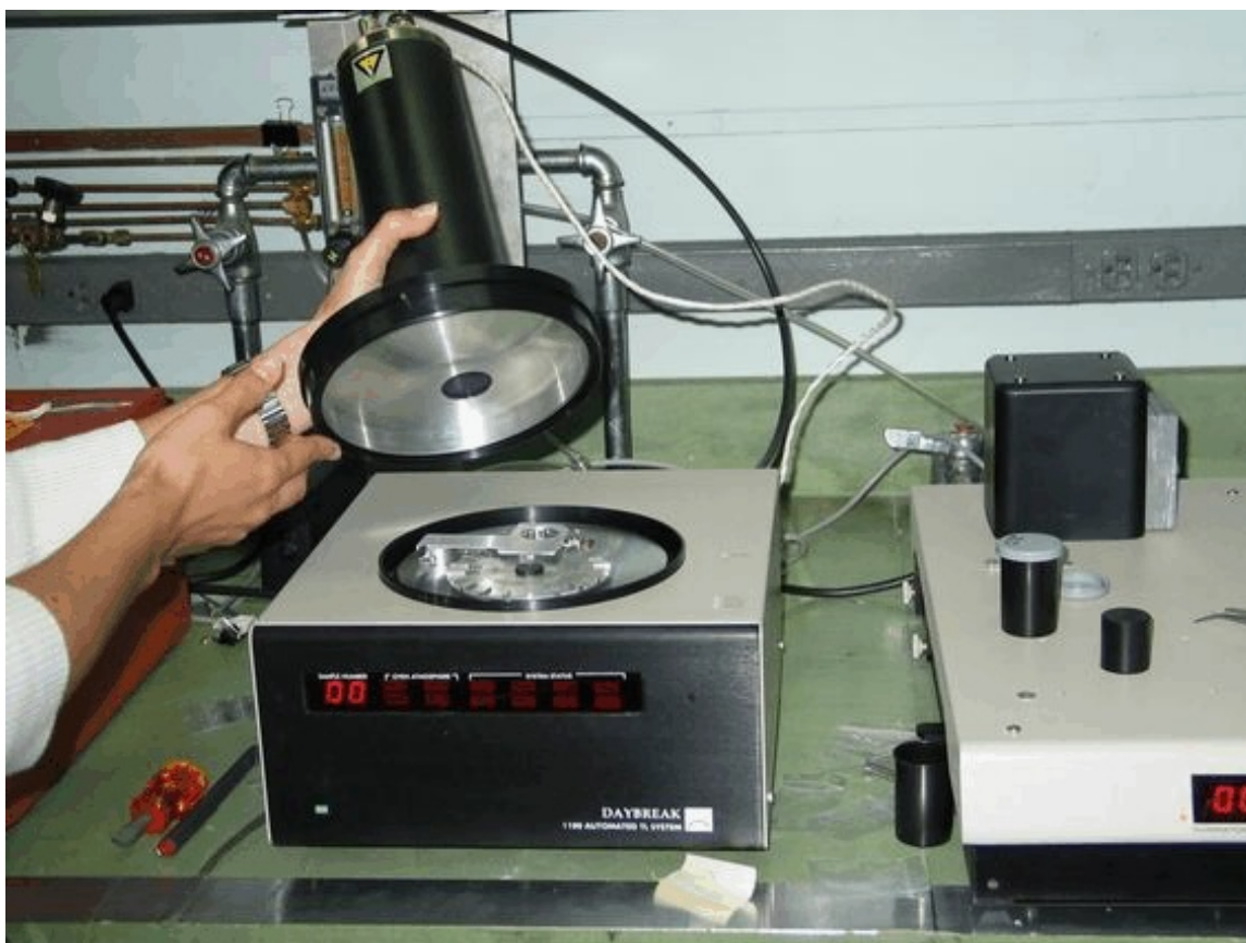
Figure 1. Daybreak Model 1100 TL system with cover and PMT assembly removed for sample loading.