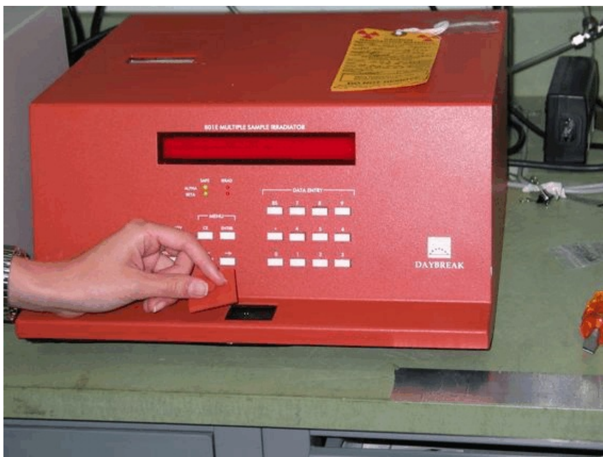
Figure 3. Sample loading station on the Daybreak Model 801E Irradiator. Note the red LED readout and the programming keys on the front panel.

Use the arrow keys to highlight LOAD, and press <ENTER> when finished. The display shows the platter position that is at the load door on the front apron of the 801E, shown in Figure 3. The platter has a 0.5-mm-deep well for 10-mm-diameter sample disks or planchets at each position. There is a deeper well in the center of each position for 3-mm-square dosimeter chips as well.