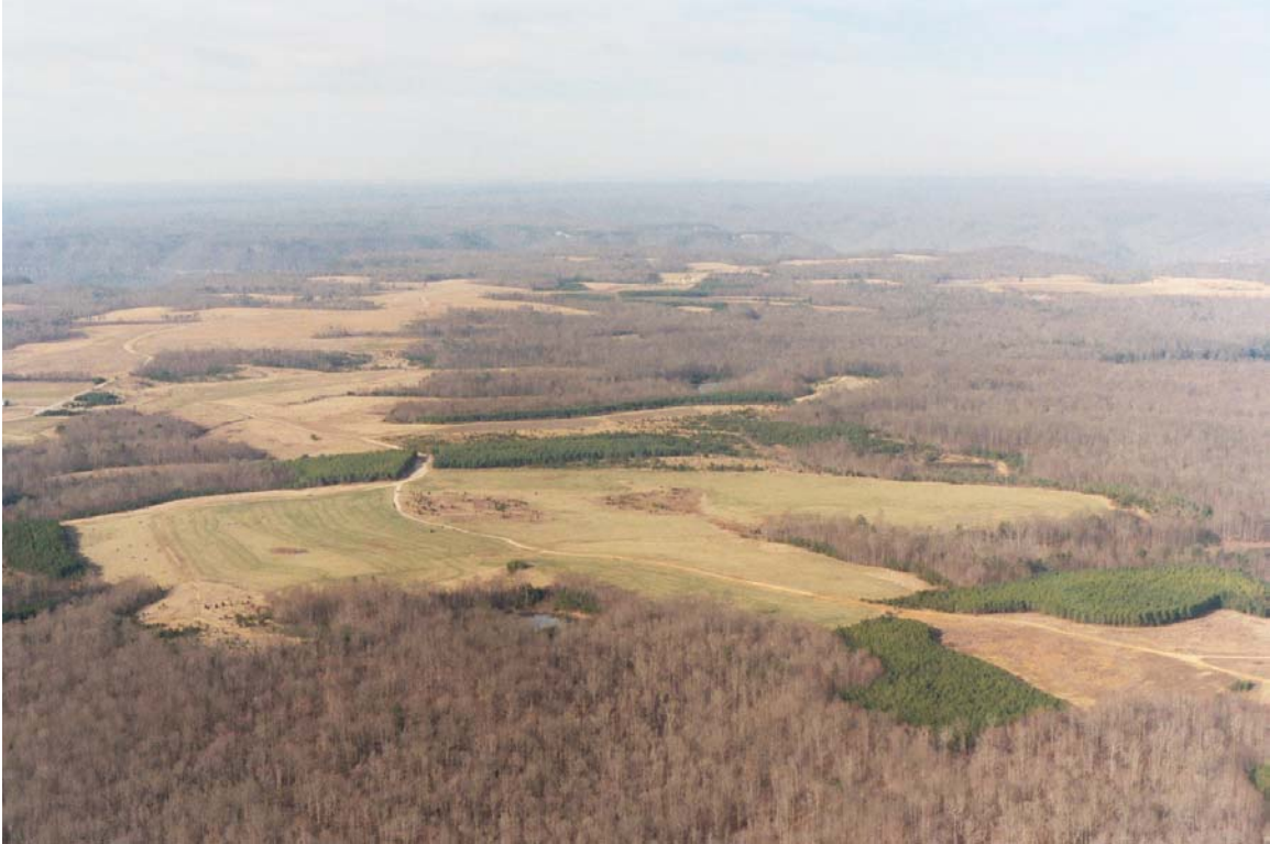
Fig. 1. Aerial view of Northern Cumberland Plateau near Jamestown, TN, displaying a matrix of forest-types and land uses.