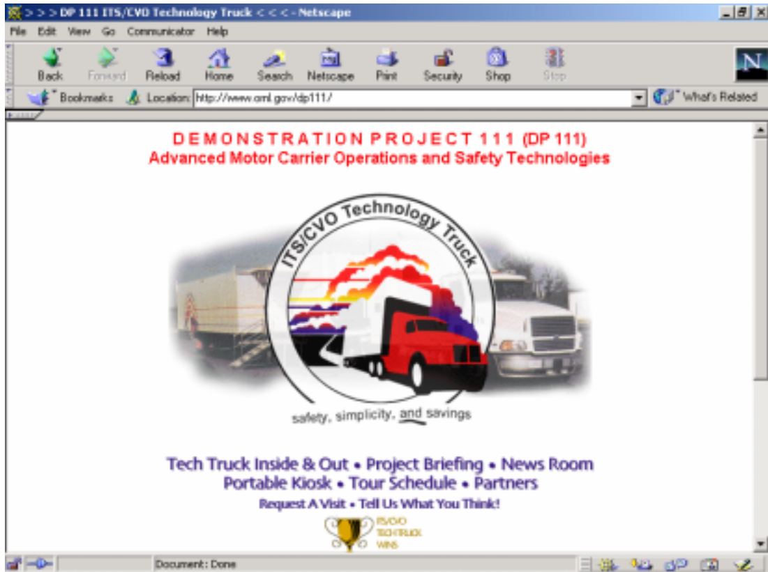
Fig. 7. View of the Technology Truck website homepage.