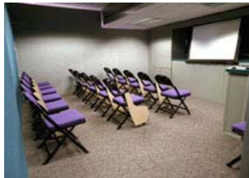
Fig. 2. Multimedia classroom.

The Technology Truck featured a multimedia classroom, which was equipped with a projection system supported by a computer and VCR and had seating for 20 participants (Fig. 2). The classroom also featured soundproof walls so that briefings could be held simultaneously with hands-on workshops, thereby maximizing the use of space and time.