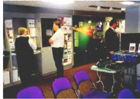
Fig. 6. Hands-on demonstrations.

The hands-on demonstration areas gave the participants the opportunity to interact with technologies firsthand and observe their capabilities. The hands-on demonstration area was divided into two sections, the computer area and the tabletop areas. The computer area included two computers with interactive software featuring logistics, weather, routing and mileage, tracking, communications, vehicle diagnostics, compliance, fleet management, public safety software for roadside enforcement activities, and other software. The tabletop areas included on-board driver- and systems-monitoring computers, automatic ice chains, on-board scales, automatic tire pressure monitoring and inflation systems, a hazardous materials spill containment kit, obstacle detection systems, brake monitoring systems, and other demonstration equipment. (Fig. 6)