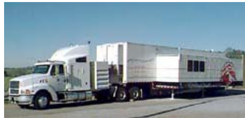
Fig. 1. A side view of the Technology Truck.

The Technology Truck project team strived to support the FMCSA mission by developing and deploying a mobile exhibit consisting of a tractor and a 48-foot trailer with expandable sides (Fig. 1). Serving as a classroom and briefing facility on wheels — equipped with classroom presentations, interactive kiosks, hands-on demonstrations, and a cab simulator — this mobile unit provided a user-friendly environment featuring the latest available state-of-the-practice intelligent transportation systems (ITS) technologies designed to improve both the efficiency and safety of commercial vehicle operations (CVO).