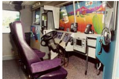
Fig. 5. Cab simulator.

The cab simulator (Fig. 5) offered participants, especially end users, the opportunity to see in-cab ITS technologies in a real-world environment. The cab featured two seats, a steering wheel, a dash, and a windshield that was capable of changing to three scenes representing driving down the road, leaving the terminal, and coming up on a weigh station. Technologies in the simulator included communication devices, on-board computers, collision avoidance systems, a transponder for weighstation bypass, a road-surface-temperature sensor, intelligent mirrors, ergonomic anti-fatigue seats, and other instruments.