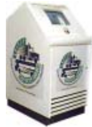
Fig. 4. Portable kiosk.

In addition to the kiosks located inside the Technology Truck, a portable multimedia kiosk (Fig. 4) containing information on products, services and programs, and workshops appropriate for specific audiences was available for expositions, conferences, or other meetings where the trailer could not be scheduled. The weight of the kiosk is approximately 350 lb, and its dimensions are width, 24 in.; depth 31 in.; and height, 49 in. The mobile kiosk appeared at 31 events in 23 cities in 15 states.